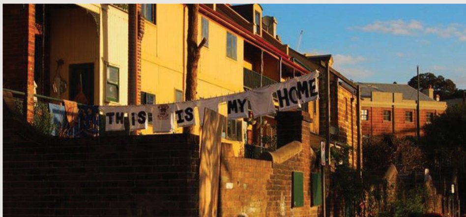
The Millers Point community is fighting to get it's message out

The late 1960s and 70s saw another massive transformation hit the area