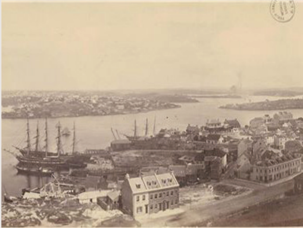
Millers Point and surrounds during early european settlement

NEWSLETTER OF THE TENANTS' UNION OF NSW # 108 NOVEMBER 2014